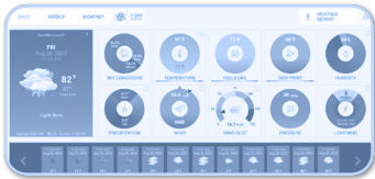
Current and Historical Weather Data