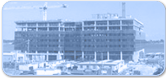
Live Streaming Video

Specification includes camera system and managed services