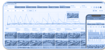
AI Media Dashboard