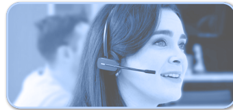
Full Service Support