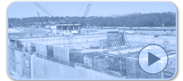
AI-Edited Time-Lapse Videos