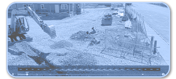
Continuous Video Recording